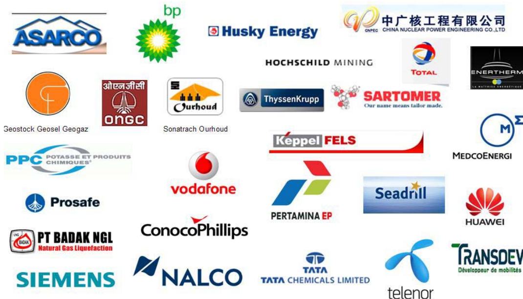
Organisations using ISRS include those above (logos approved for use by client organisations in accordance with ISRS license agreement.)

To attend the conference, please complete the form below and return to your local DNV office or to isrs@dnv.com